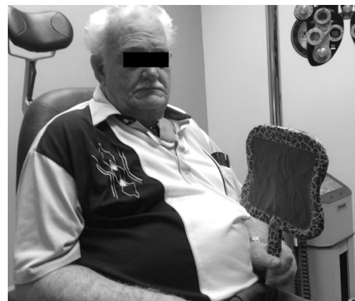
Figure 1 Preoperative picture of the patient carrying his flyswatter.

At postoperative one month from the second eye, the patient reported complete relief of symptoms. He still preferred to hold his flyswatter occasionally but his wife explained this was more of “security blanket” and that he no longer swatted at himself. The patient reported his vision was improved enough that he could now “see out of both eyes” and he no longer needed to patch the right eye. His wife reported considerable reduction in his overall agitation. Visual acuity without