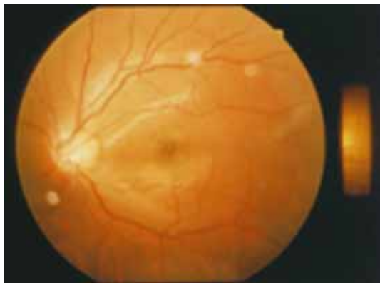
Figure 2 Fundus photography of left eye (normal)